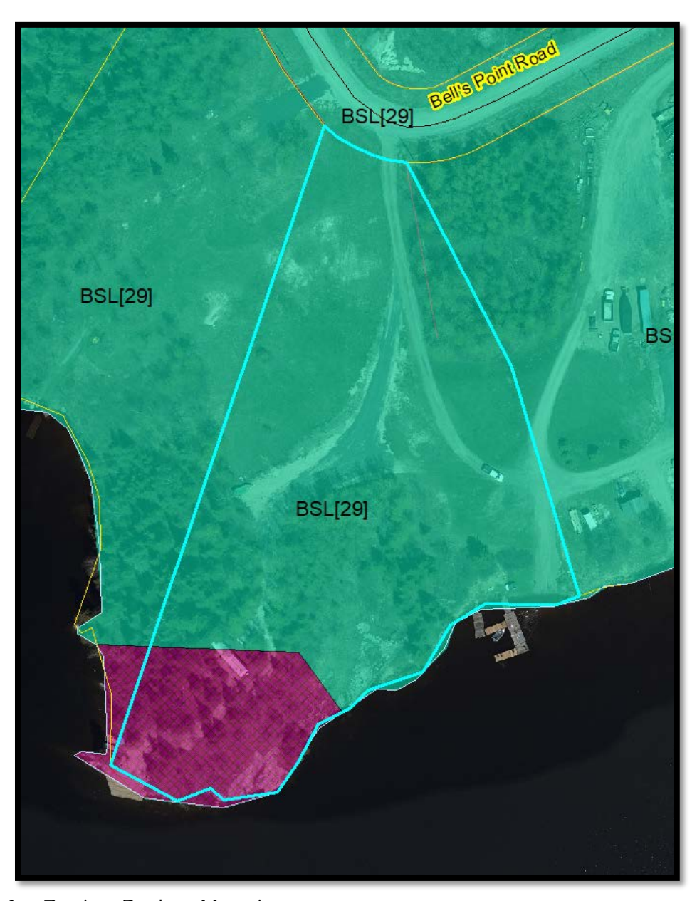
Figure 11 - Zoning By-law Mapping

Under the by-law, campers, tents, and recreational vehicles are only permitted to be occupied in camp sites in a campground, which is normally only permitted in the "TR" Tourist Recreational Zone (Section 4.8.4). No other zoning use category permits the occupation of campers, tents, and recreational vehicles, even temporarily. Trailers may be parked and stored on a lot in any zone with an existing permitted use, but may not be occupied during storage (Section 3.6). Therefore this temporary use by-law must be approved if the applicants wish to have even a single camper located on the property.