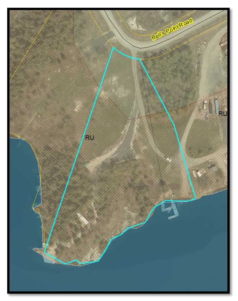
Figure 10 - OP Mapping. The hatched area indicates boundaries of the Black Sturgeon Lake (Restricted Development Area)