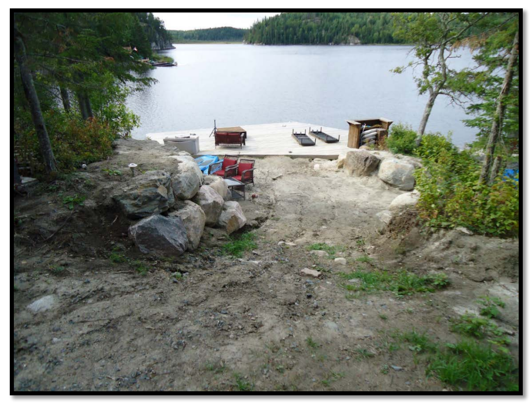
Figure 6: First unpermitted shoreline structure and adjacent landscaping in the EP zone and within the 20m buffer of an archaeological site.