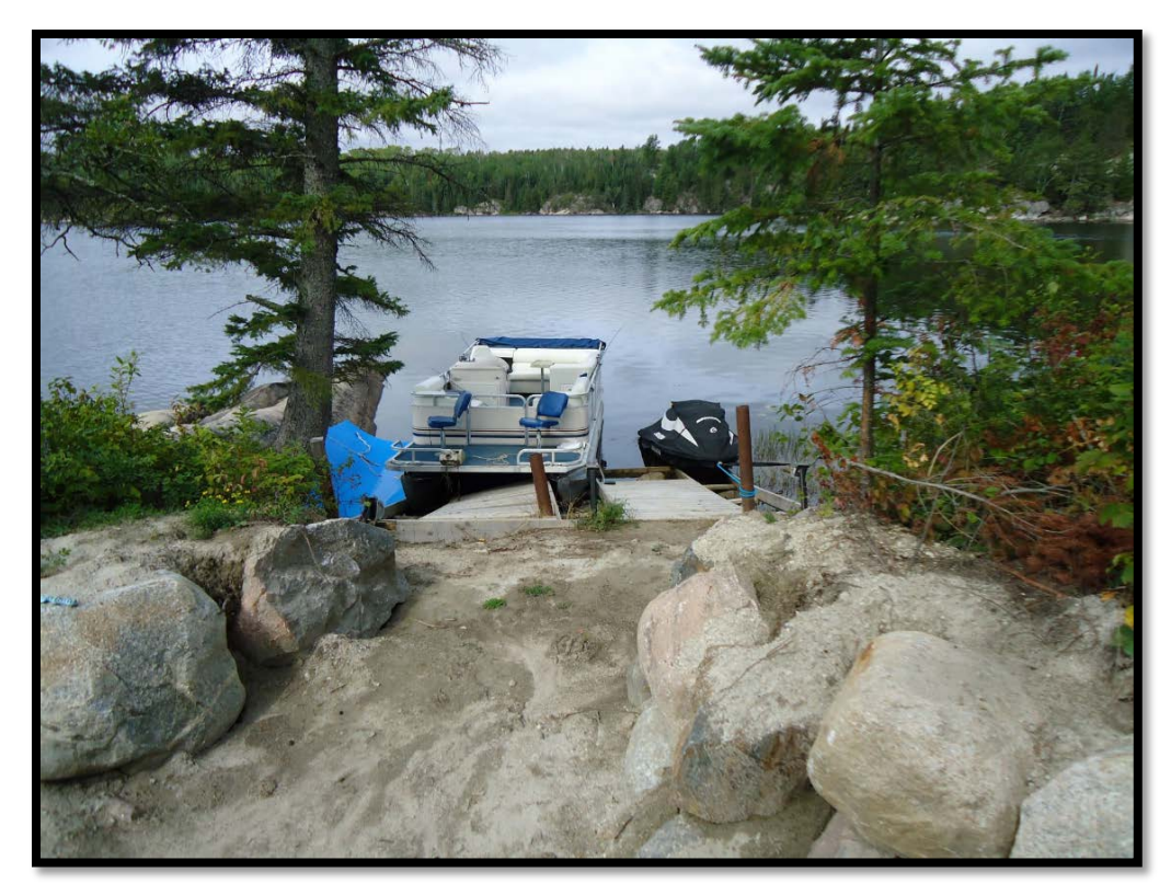
Figure 7: Second unpermitted shoreline structure and adjacent landscaping in the EP zone and within the 20m buffer of an archaeological site.