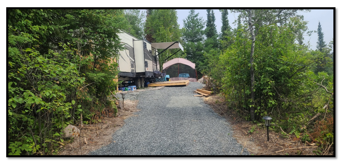
Figure 3 – Photo of camper on property.