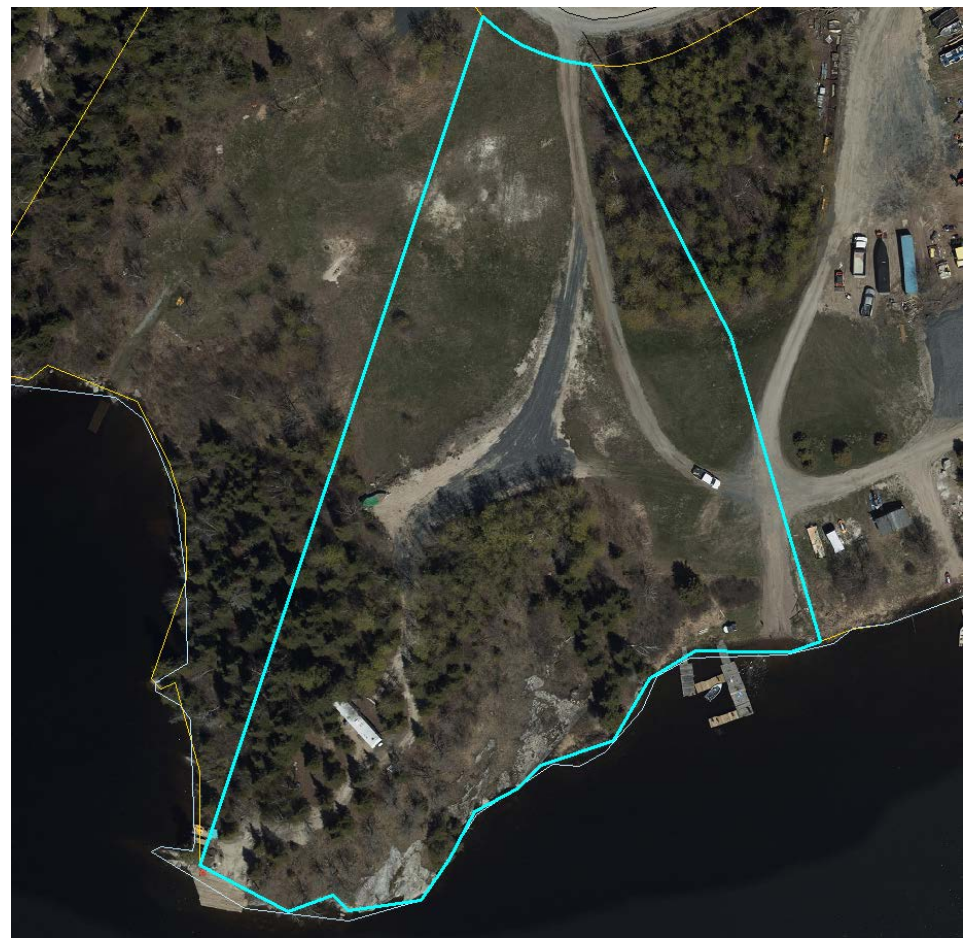
Figure 2 – 2019 Aerial image displaying boundaries of subject site, and an unpermitted trailer and shoreline structure (southwest corner).