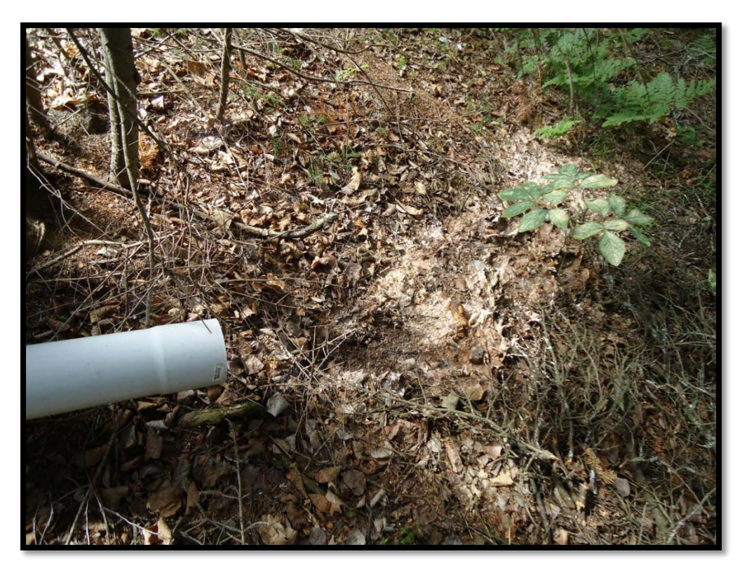
Figure 5: Release of wastewater directly on to property with no septic system