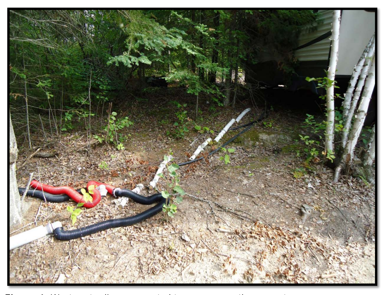
Figure 4: Wastewater lines connected to campers on the property