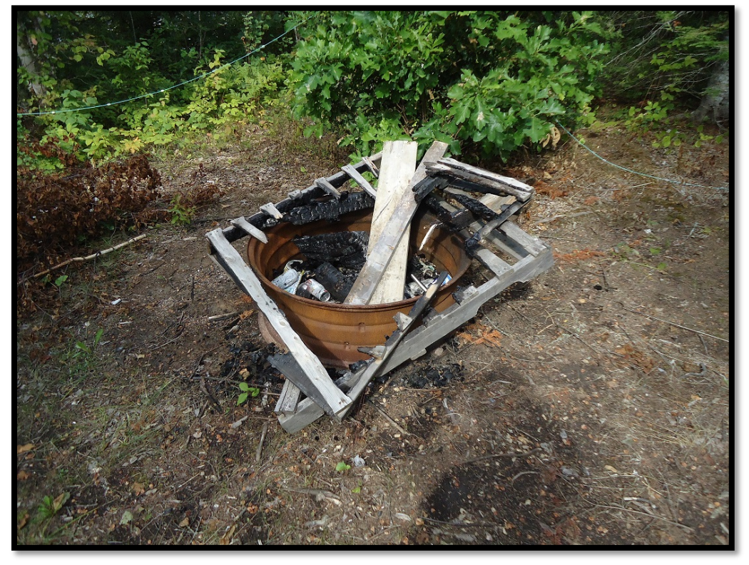
Figure 8: Evidence of recent fire documented August 26, 2021. The Restricted Fire Zone was in place from June 30^{th} until September 1^{st} .