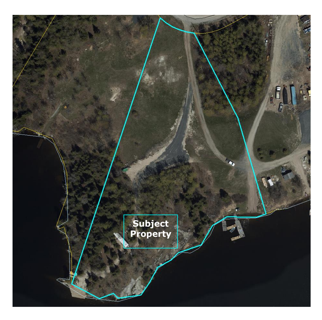
Schedule "A"- File No. D14-21-09